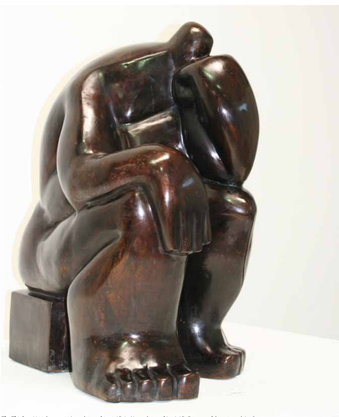
The Thinker, 2011, bronze, 114cm edition of 1 + 1 AP & 40cm edition of 8 + 2 AP. Courtesy of the artist and Art Sawa.