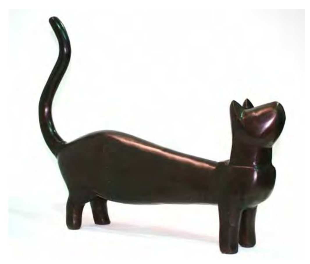
The Cat, 2009, bronze, edition of 8 + 2 AP and polyester (exhibited in Venice Biennale 2009) edition 24. Courtesy of the artist and Art Sawa.

mid dance, hands raised above their heads, or sway to the rhythms of a musical instrument that we cannot hear. Yet none of the troupe are performing together in unity. Instead, each is performing for himself, thinking he knows best and referencing what the artist believes is the broader fragmentation of the political space in Egypt and the country. Some musicians are even wielding their instruments without playing: "they don't know how to, despite their claims to the contrary", says the artist. Askalany is a prolific in his practice with so many ideas he wants to get out. He works in a variety of media, and with a range of themes, yet it is possible to detect, across his practice, a naivety or spontaneity of form resulting from the artist's conscious invocation of his childhood in a small town. Beneath the direct political satire, there is an intentional innocence that references the goodness of citizens in his hometown, a place that is both the subject and inspiration for all his work. In this way, Askalany's sculptures become talismanic in their role,